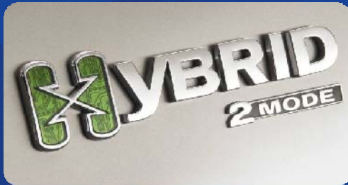
Hybrid Vehicle RADSOK & Feedback Interconnect