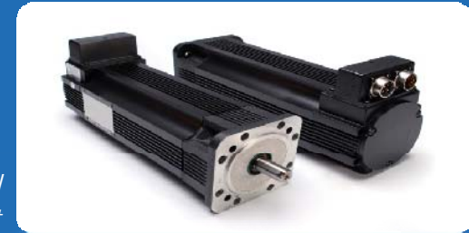
Motion Control & HV Drive Interconnect