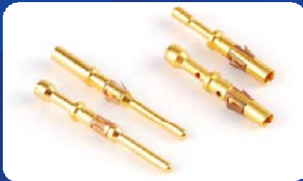
RT/RTOW™ Series Machined Contacts