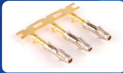
RT/RTOW™ Series Stamped & Formed Contacts