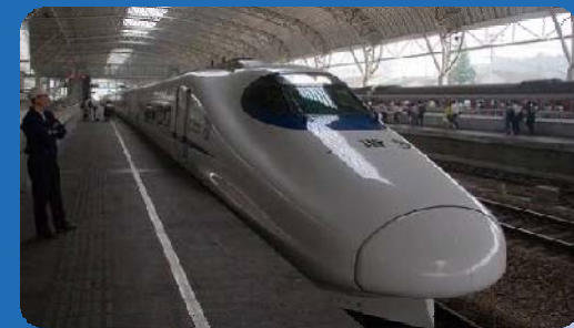
Rail / Mass Transit Interconnect