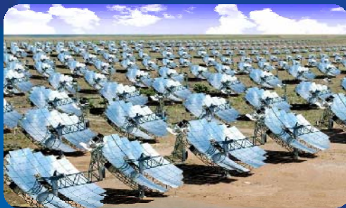
Green Energies / Solar Power Interconnect