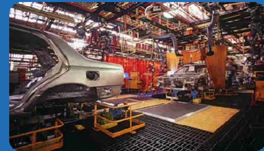
Industrial Automation / Robotics Interconnect