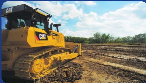
Construction / Off-Road Heavy Equipment Interconnect